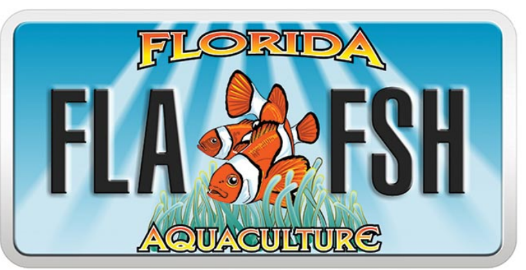
Harbor Branch Oceanographic Institute Foundation

We are grateful for their continued support for the FAA.